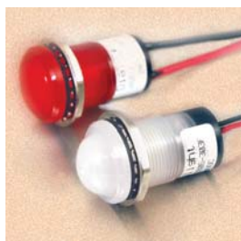
Rugged 657 Series Indicator Lights