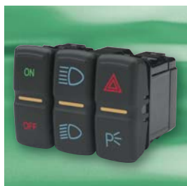
Multiplex Switch Modules