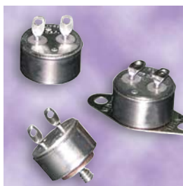
2288 Series Bi-Metal Thermostats